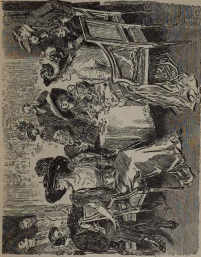
"Her poise, her unconsciousness, the winning simplicity of her manner were noticed everywhere."